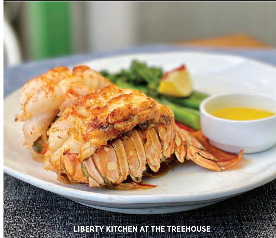
LIBERTY KITCHEN AT THE TREEHOUSE