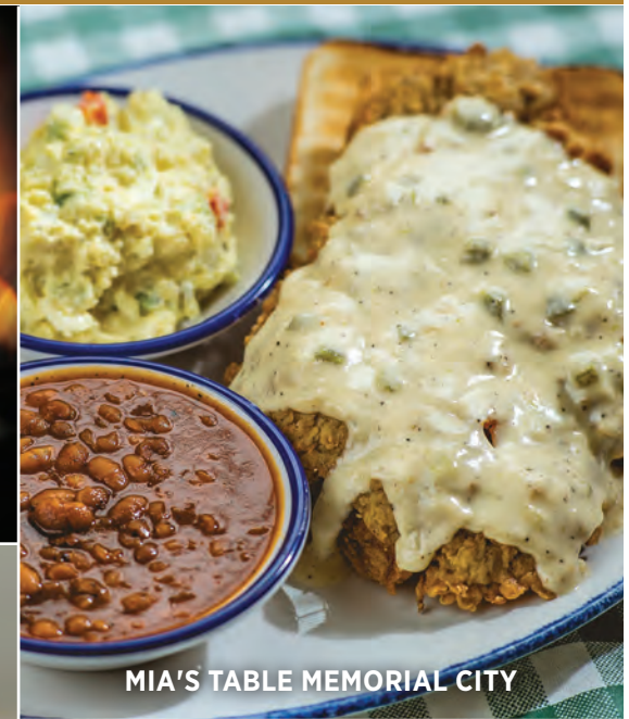
MIA'S TABLE MEMORIAL CITY