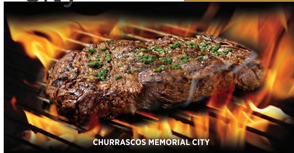
CHURRASCOS MEMORIAL CITY