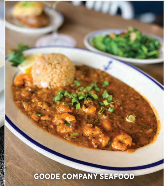
GOODE COMPANY SEAFOOD