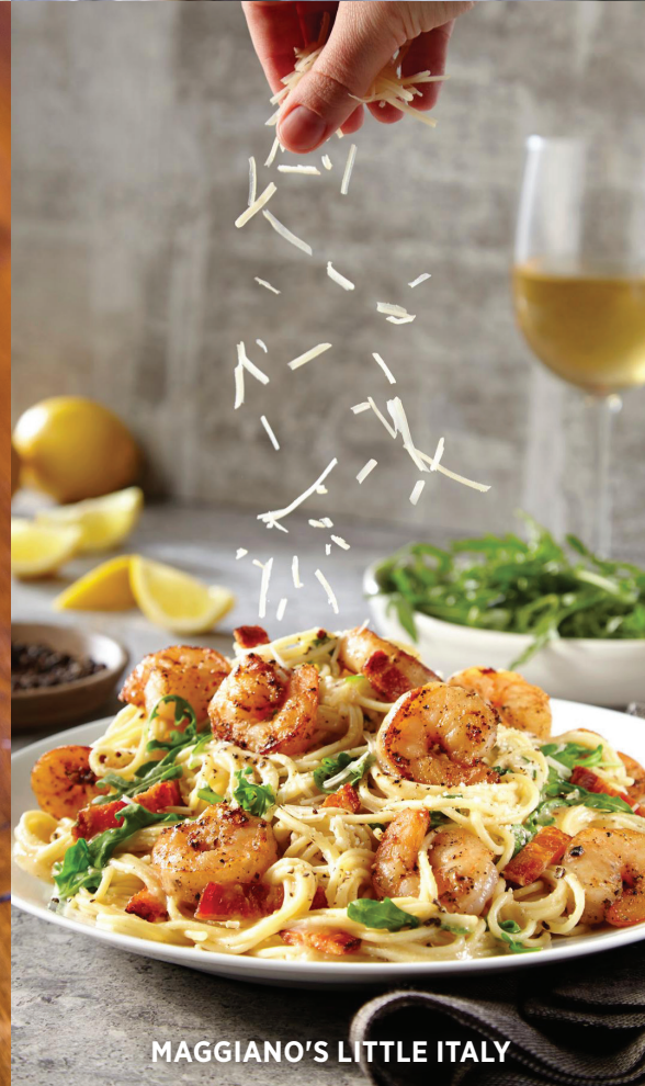
MAGGIANO'S LITTLE ITALY