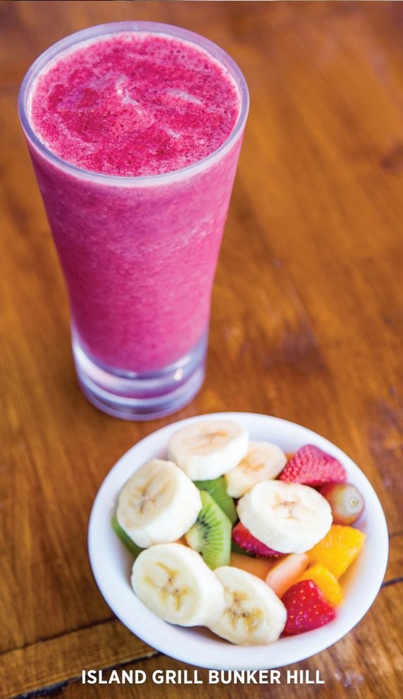
ISLAND GRILL BUNKER HILL