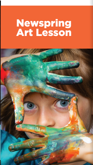
Newspring Art Lesson