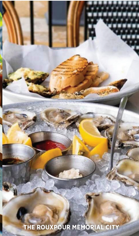
THE ROUXPOUR MEMORIAL CITY