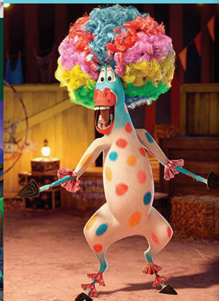
Madagascar 3: Europe's Most Wanted