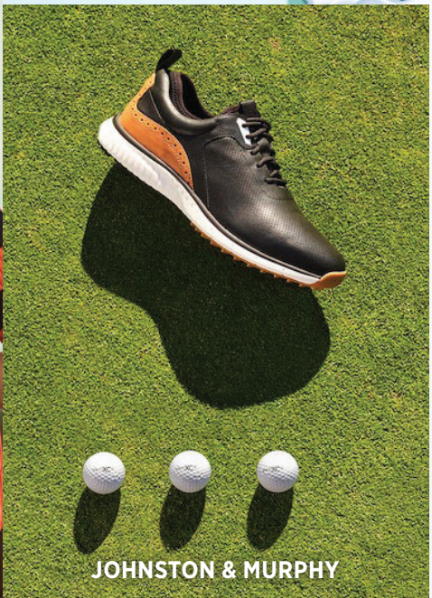
JOHNSTON & MURPHY