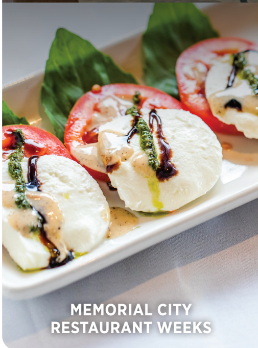
MEMORIAL CITY RESTAURANT WEEKS