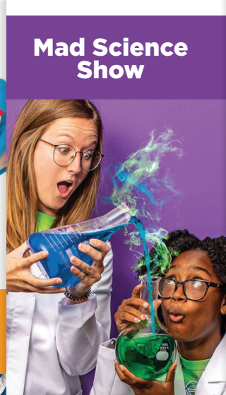
Mad Science Show