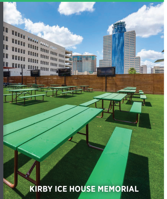
KIRBY ICE HOUSE MEMORIAL

1015 Gessner Road 713.468.3722 www.kirbyicehouse.com