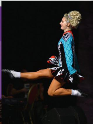
Irish Dance Showcase