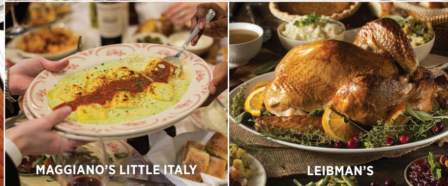
MAGGIANO'S LITTLE ITALY