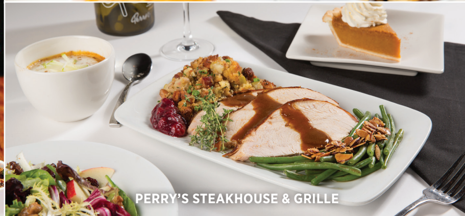
PERRY'S STEAKHOUSE & GRILLE