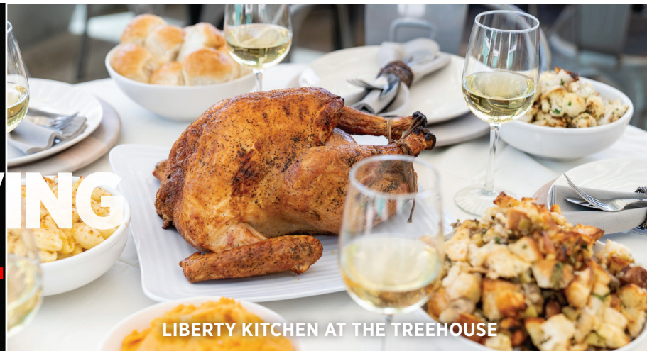
LIBERTY KITCHEN AT THE TREEHOUSE