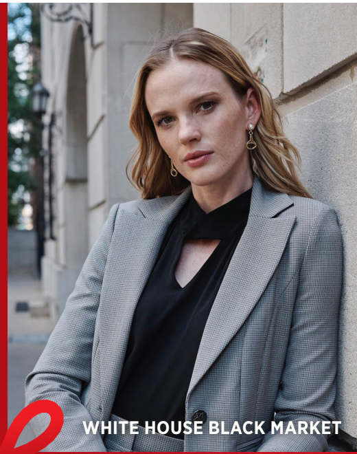
WHITE HOUSE BLACK MARKET