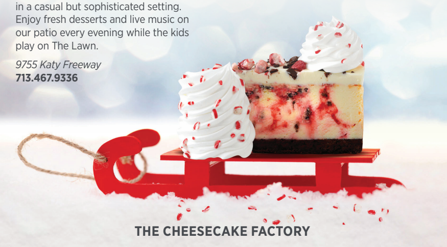
THE CHEESECAKE FACTORY

Gateway Memorial City 947 Gessner Road 713.231.1352