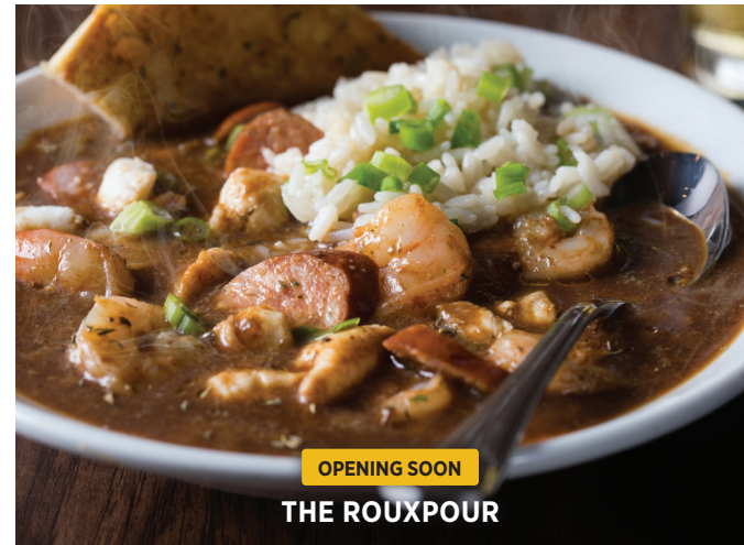
OPENING SOON THE ROUXPOUR