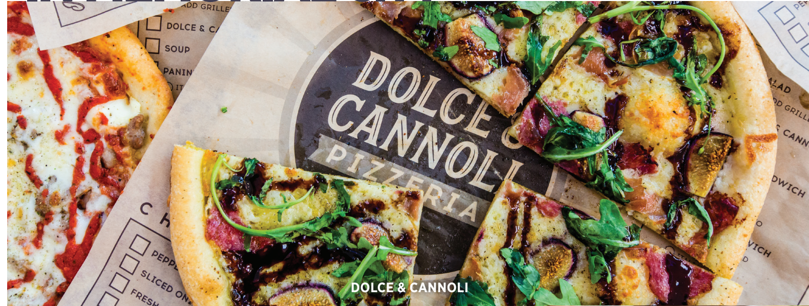
DOLCE & CANNOLI

October is the perfect month to try something new, and Memorial City has something for everyone!