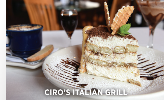
CIRO'S ITALIAN GRILL