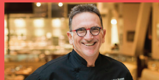
CHEF RICK MOONEN