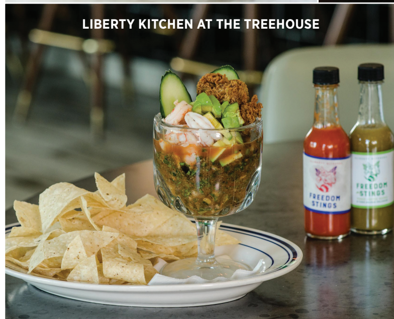
LIBERTY KITCHEN AT THE TREEHOUSE