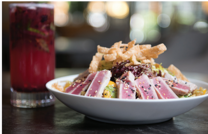
TIPPING POINT RESTAURANT AND TERRACE