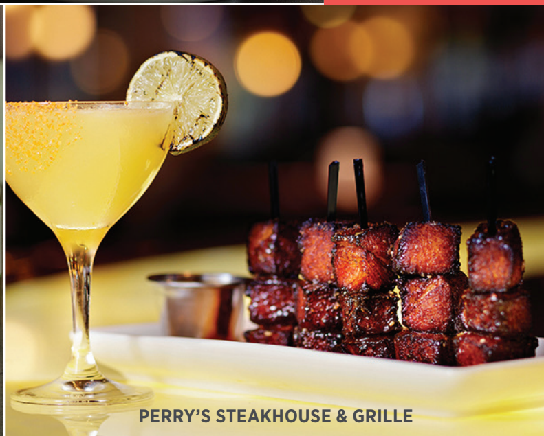
PERRY'S STEAKHOUSE & GRILLE