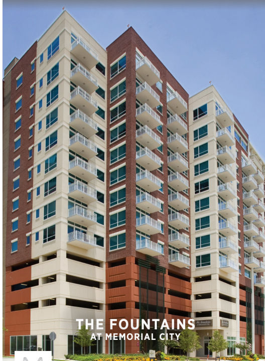
THE FOUNTAINS AT MEMORIAL CITY