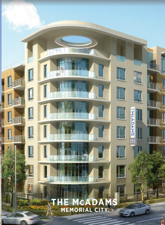
THE McADAMS MEMORIAL CITY