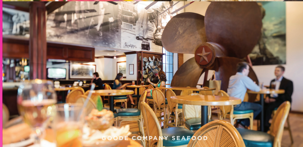
GOODE COMPANY SEAFOOD