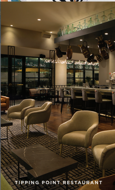
TIPPING POINT RESTAURANT

Dine out for an unforgettable Mother's Day brunch at Tipping Point Restaurant at the all-new Hotel ZaZa Memorial City . As long as you're there, you might as well make Mom's day with a visit to the luxurious ZaSpa , with acclaimed treatment menus that focus on seasonal and local products all within a peaceful, tranquil space. ZaSpa promises a restorative experience for the senses and a relaxing escape. What Mom wouldn't want that?