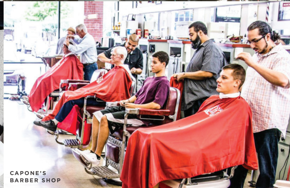
CAPONE'S BARBER SHOP