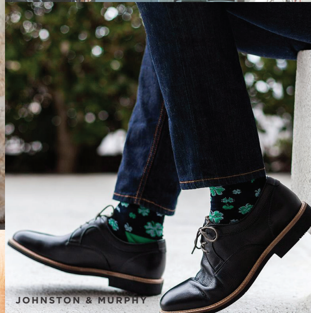
JOHNSTON & MURPHY