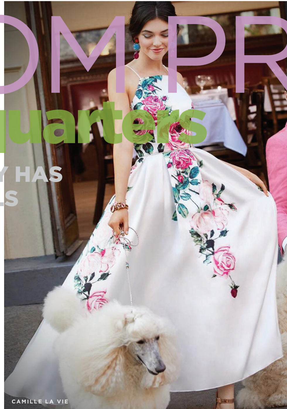
CAMILLE LA VIE

Gorgeous prom dresses come in all silhouettes and all sizes at Camille La Vie. Choose from timeless designs, contemporary styles and modern prints and a palette of bright and bold to classic and neutral colors.