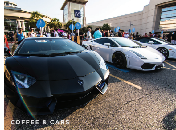
COFFEE & CARS