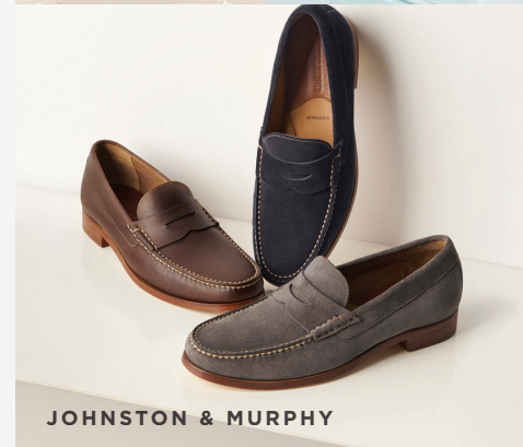
JOHNSTON & MURPHY