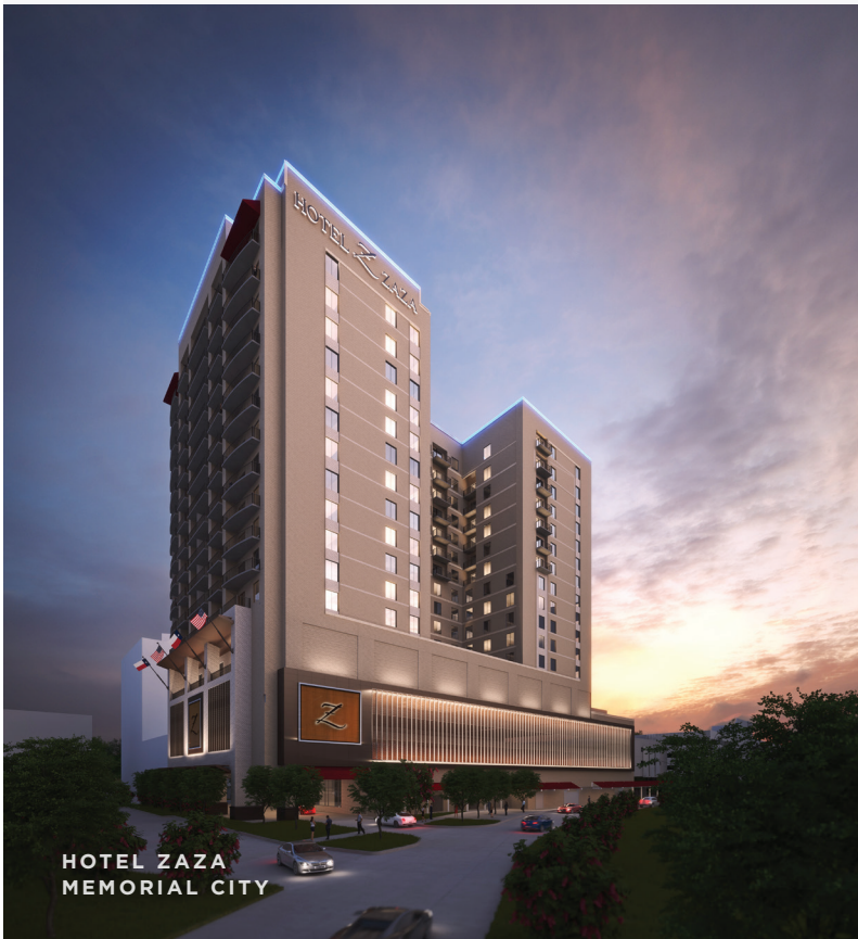
HOTEL ZAZA MEMORIAL CITY

MEMORIAL CITY IS HOME TO TWO OF HOUSTON'S MOST ESTEEMED HOTELS: HOTEL ZAZA MEMORIAL CITY AND THE WESTIN MEMORIAL CITY, EACH OFFERING UNPARALLELED EXTRAVAGANCE AND COMFORT TO EVERY GUEST.