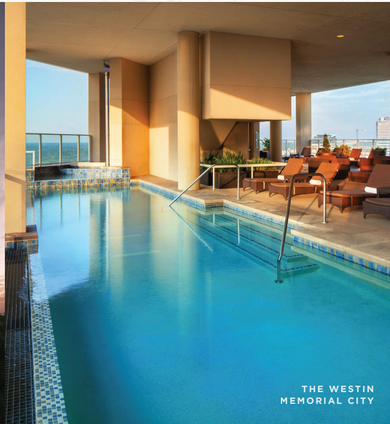
THE WESTIN MEMORIAL CITY