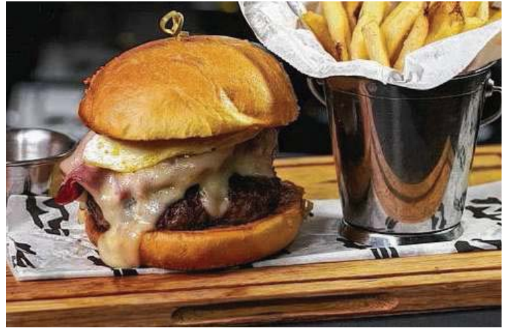
The Big Rock burger at Stone Werks in San Antonio. The institution has been around for two decades.

And, don't think we're full yet. The party is just getting started with the best beats and eats from the ACL Music Festival. This year's show may already be a memory, but the good food found on its grounds lasts year-round! Outrageous sights, sounds and eats at Austin's famed Zilker Park. You can get more details and catch up on any of the episodes you've missed at Goodtaste.tv . But today, set those DVR's for KPRC, Sunday morning at 5:30 a.m.